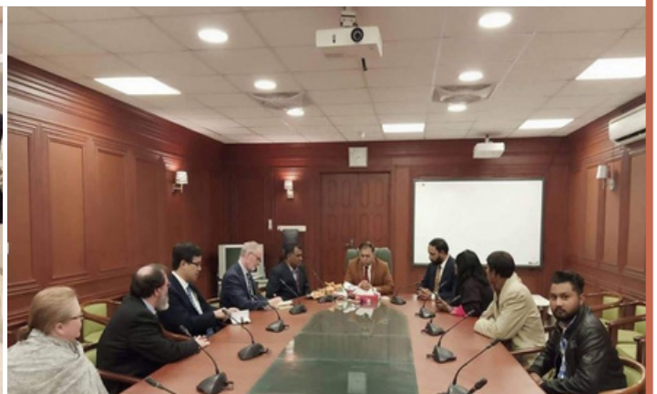
International Delegation visited Supreme Court of Pakistan