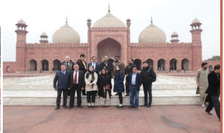
International Delegation visited Badshahi Mosque Lahore - Pakistan