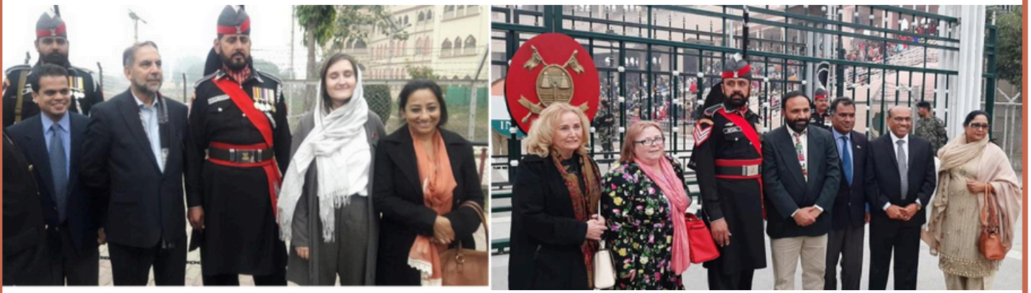
International Delegation visited Wahga Border - Pakistan