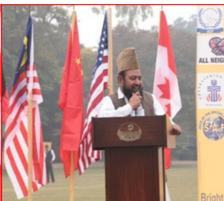
Mufti Ashiq Hussain - Pakistan