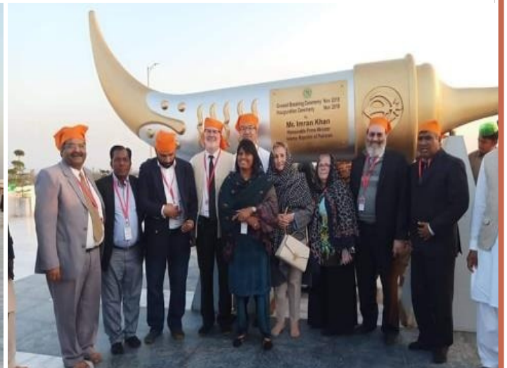
International Delegation visited Kartar Pur Rahdari - Pakistan