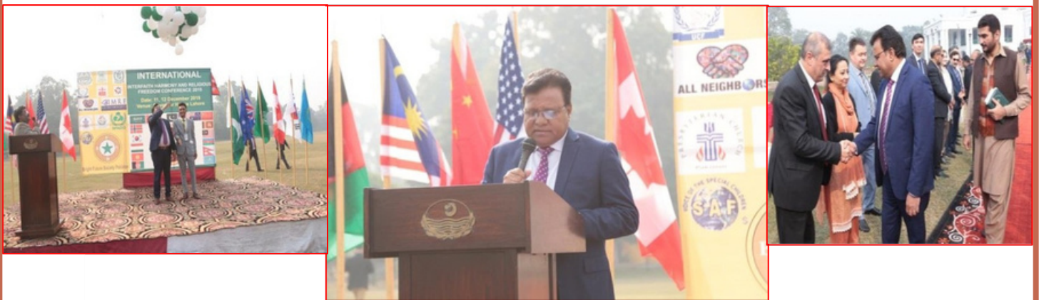
Welcome Address Ijaz Alam Augustine Minister Human Rights Minority's Affairs